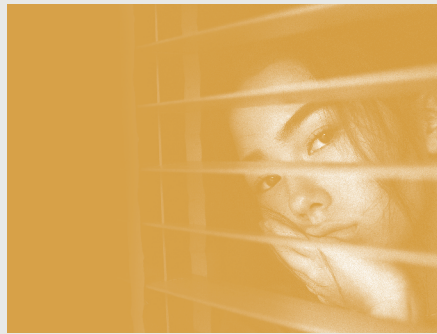
Human Trafficking - Child Sex Trafficking