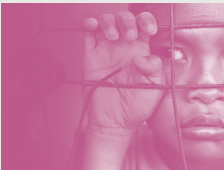
Pediatric Sexual Assault